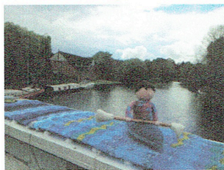
... come rain