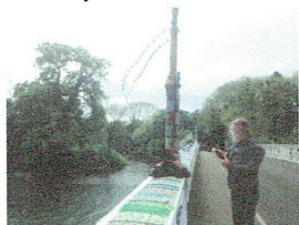
... Come wind