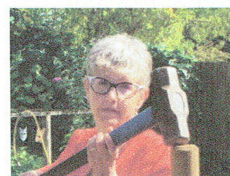
... a sledgehammer,