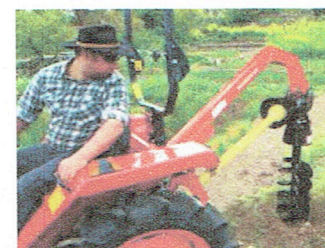
a post hole borer ...