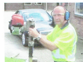
a post thumper or ...

We could do with help from someone with either