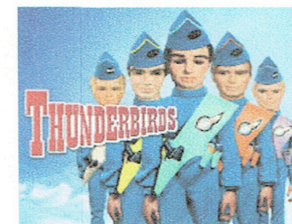
or maybe this crew?