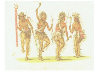
and rain dancing.

We could do with help from someone with either