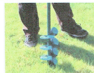
... a post auger