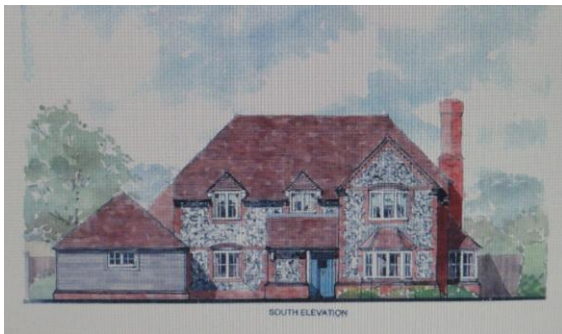
South elevation of proposed house