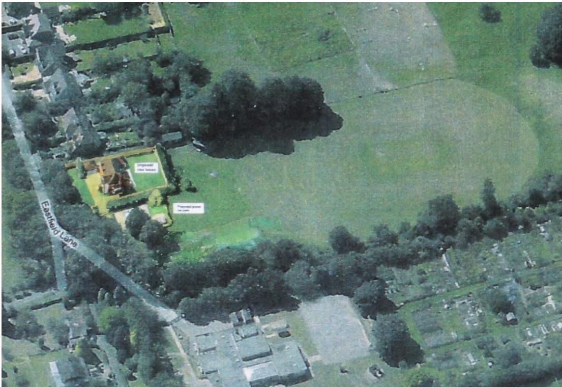
Aerial view of cricket field showing proposed new house and car park