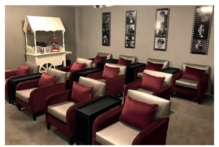
Photographs show a similar development